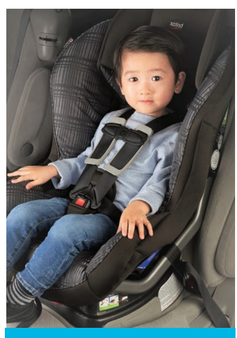
Child seat installed forward-facing