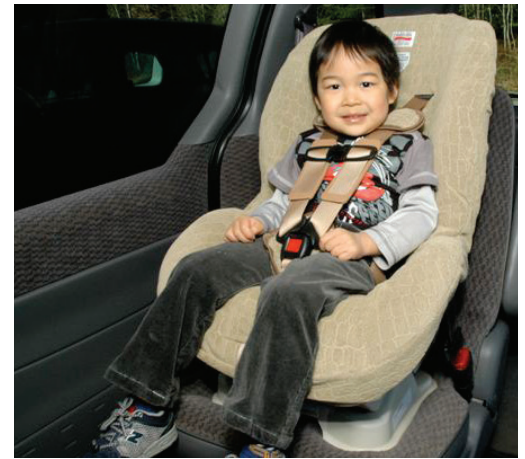
Child seat installed forward-facing