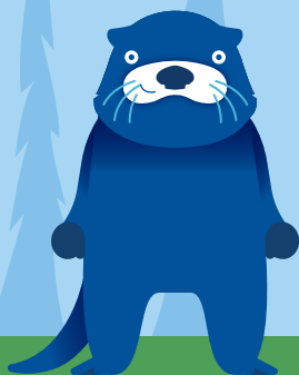
Victoria The Otter