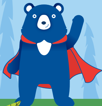
Blue The Bear